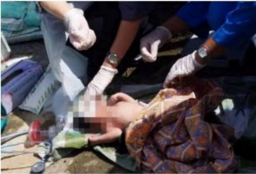
Police are now tracking a 18-year-old boy, believed to be the girl's boyfriend and the father of the baby.

A 18-year-old girl was arrested for allegedly throwing a newborn baby from a residential unit on the fourth floor of a flat in Persiaran Mayang Pasir 5, Bayan Baru near here today.