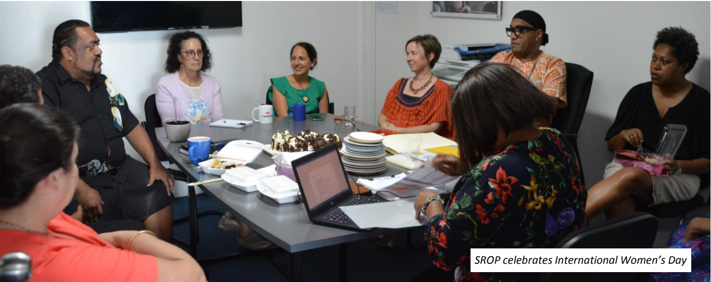
SROP celebrates International Women’s Day