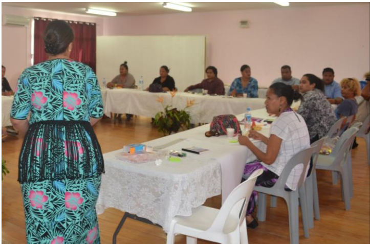
TFHA media training